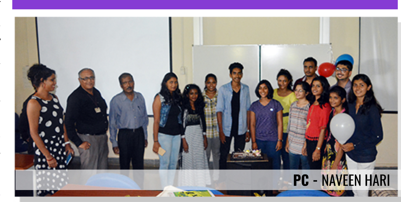
A still from Freshers' day celebration 2017-18.

The opinions/News appearing herein are those of the editor/ reporters and cannot be attributed to the principal/College